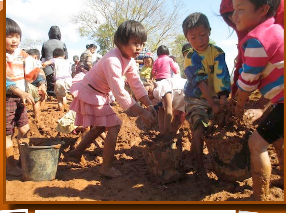
with teachers, students and community members in Northern Shan State