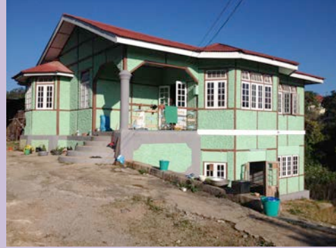
The new centre and our home in Kalaw

We have settled in to our new home which will also serve at least temporarily as the base for the Sprouting Seeds Learning Centre. Already only just the beginning of the cold season and the temperature here has dropped to mid to high 30's and temperatures are said to get down to freezing towards the end of the month.