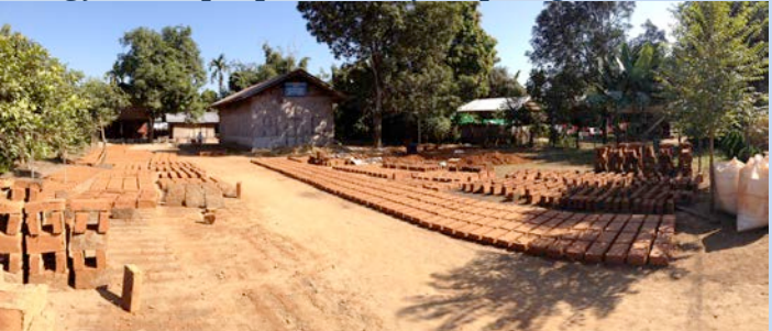
Mud bricks ready for the new kindergarten!

During the trip to Korea, participants from the Kachin group requested further support in the form of an Advanced Training of Trainers to be held in Myitkyina, Kachin State in Upper Myanmar. The group organized the training while we were in Korea and invited me to join them in early December. I just returned from an amazing trip and the networking and collaborations as well as energy of the people are very inspiring!