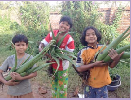
Moving our giant aloe

New beginnings and new places seem to be the way of things here in Myanmar for us. In November we moved from our home in Pyin Oo Lwin to Kalaw, another, smaller former British hill station located in the pine forested hills of Southern Shan State not far from Inle Lake and Taunggyi. I continue my work with American Friends Service Committee (AFSC), Spirit in Education Movement (SEM) and our Myanmar based Socially Engaged Monastic Schools (SEMS) and Center for Promotion of Monastic Schools (CPME).