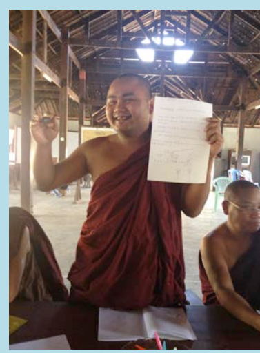
Inspired monk ready to "green" his monastery

With the senior abbots approval, the teachers can then be trained and begin implementation of new teaching methods and models within their classrooms. The brief gathering inspired the group of abbots and they are already making plans for themselves and their teachers to gain further training.