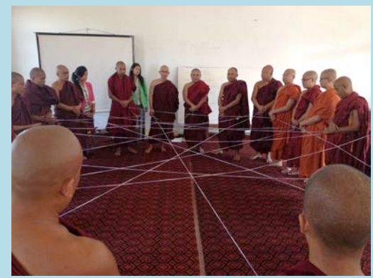
Spider Web game to support networking

In April, Naung Taung Monastic School near Taunggyi in Southern Shan State, hosted an Abbot Retreat for 3 days. The retreat was a key time for bringing a core group of senior abbots from all over Southern Shan State in Easter Myanmar together to share experiences, network and begin collaborations together. It was also a key time to expose them to new ideas around holistic education and sustainability.